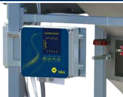
ELECTRONIC CONTROL PANEL individually programmable according to specific material properties