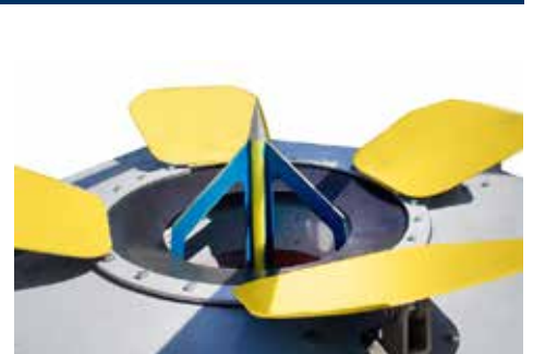
CUTTING KIT 3-blade configuration enhancing cutting performance