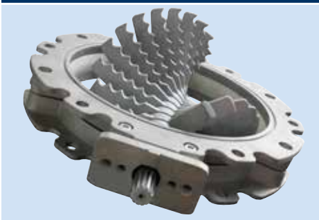
LUMP BREAKING FEEDER VALVE aiding material flow